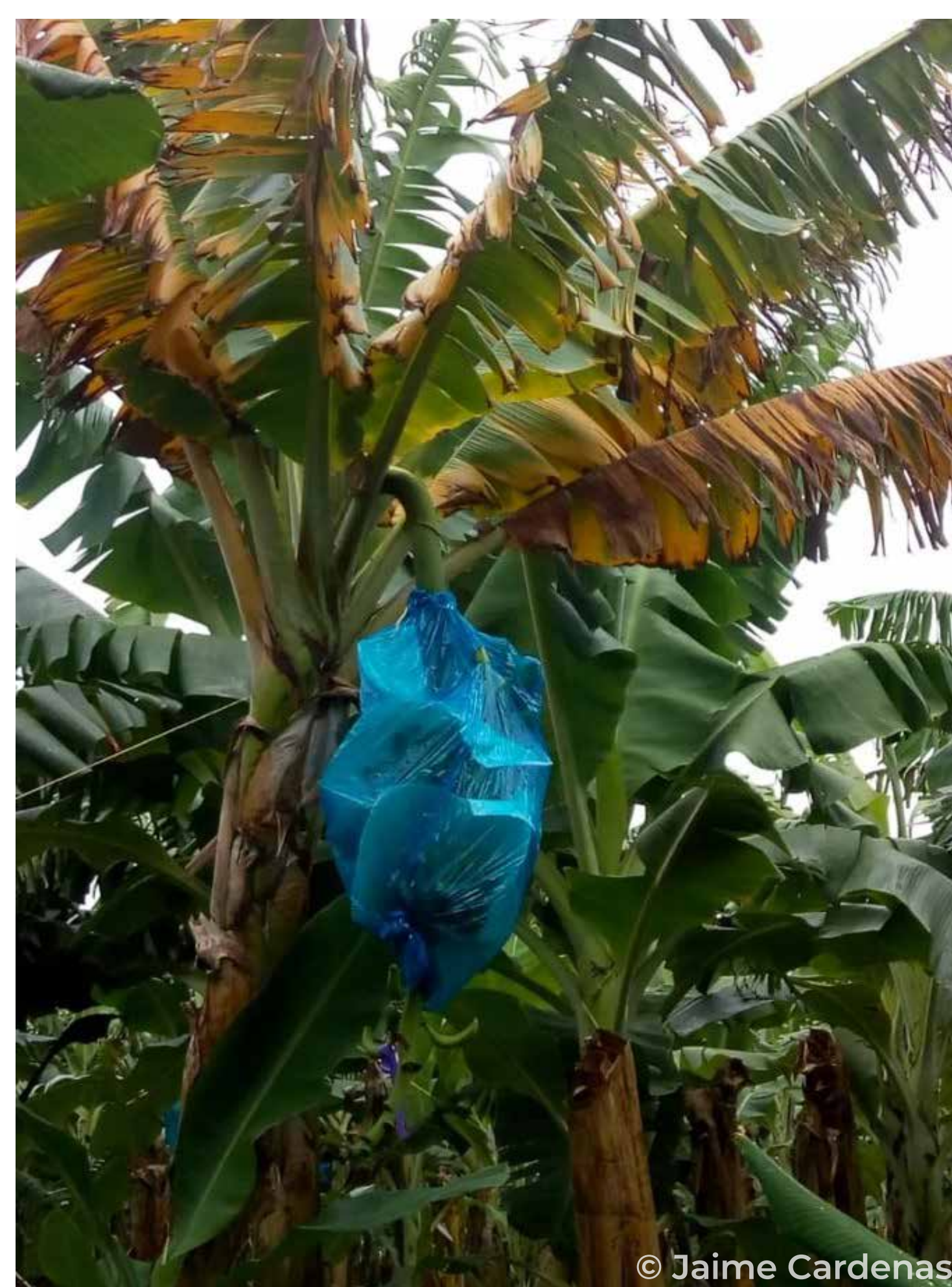
Leaves turning yellow and the leaf margins turning brown.