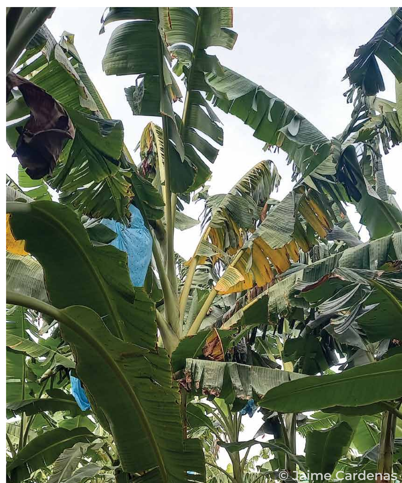
Yellowing of leaf at the base of older leaves.