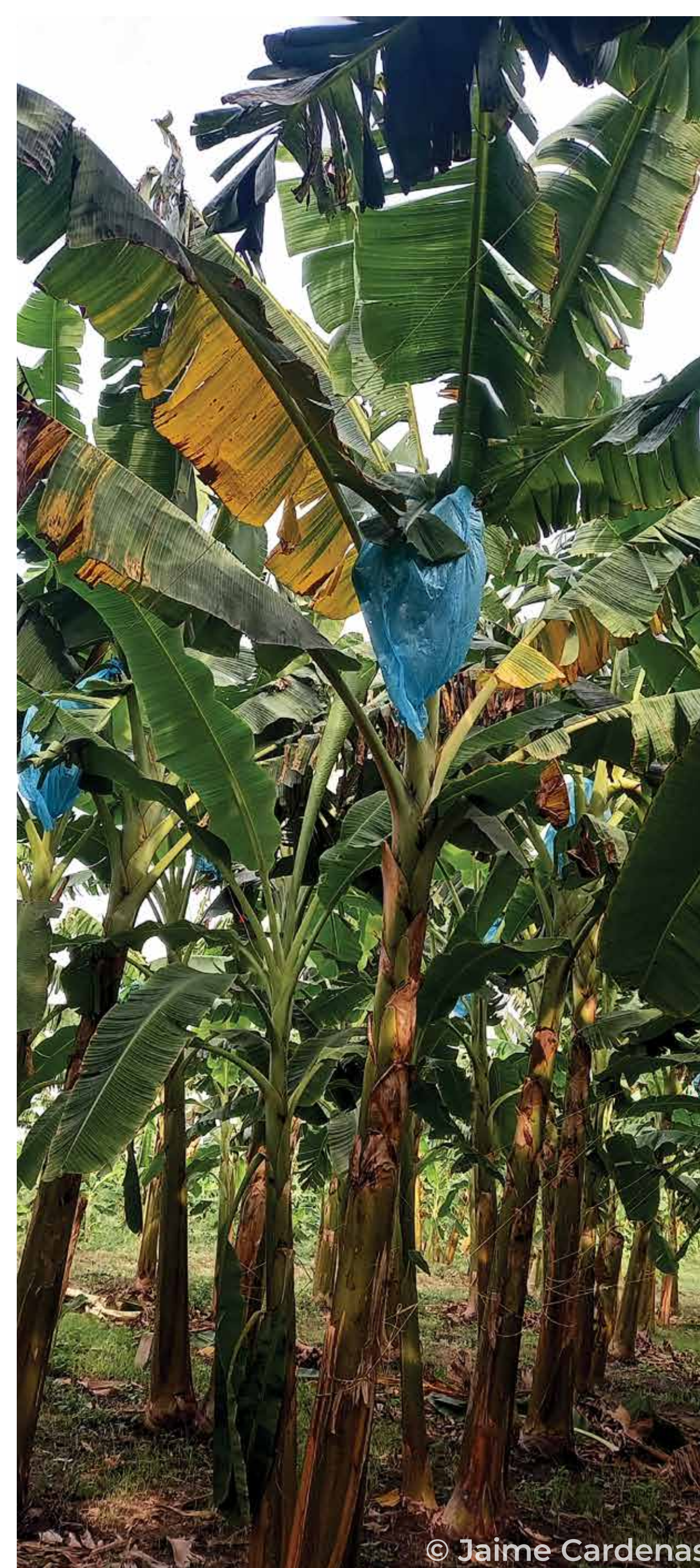
Dead leaves collapsing and forming a skirt of dead leaves around the stem of the plant.