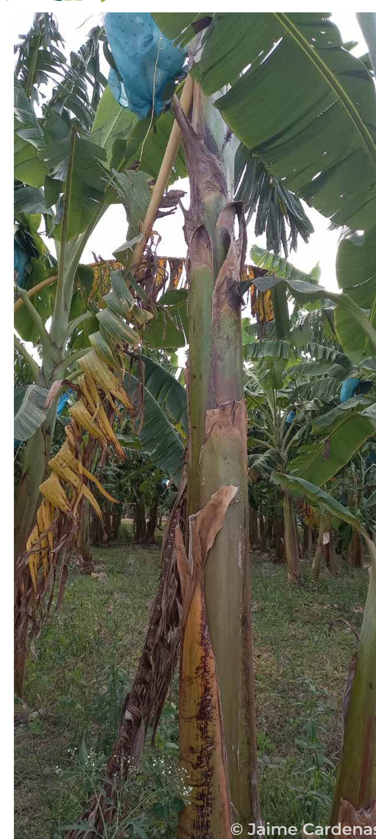
Younger leaves can remain green and upright.