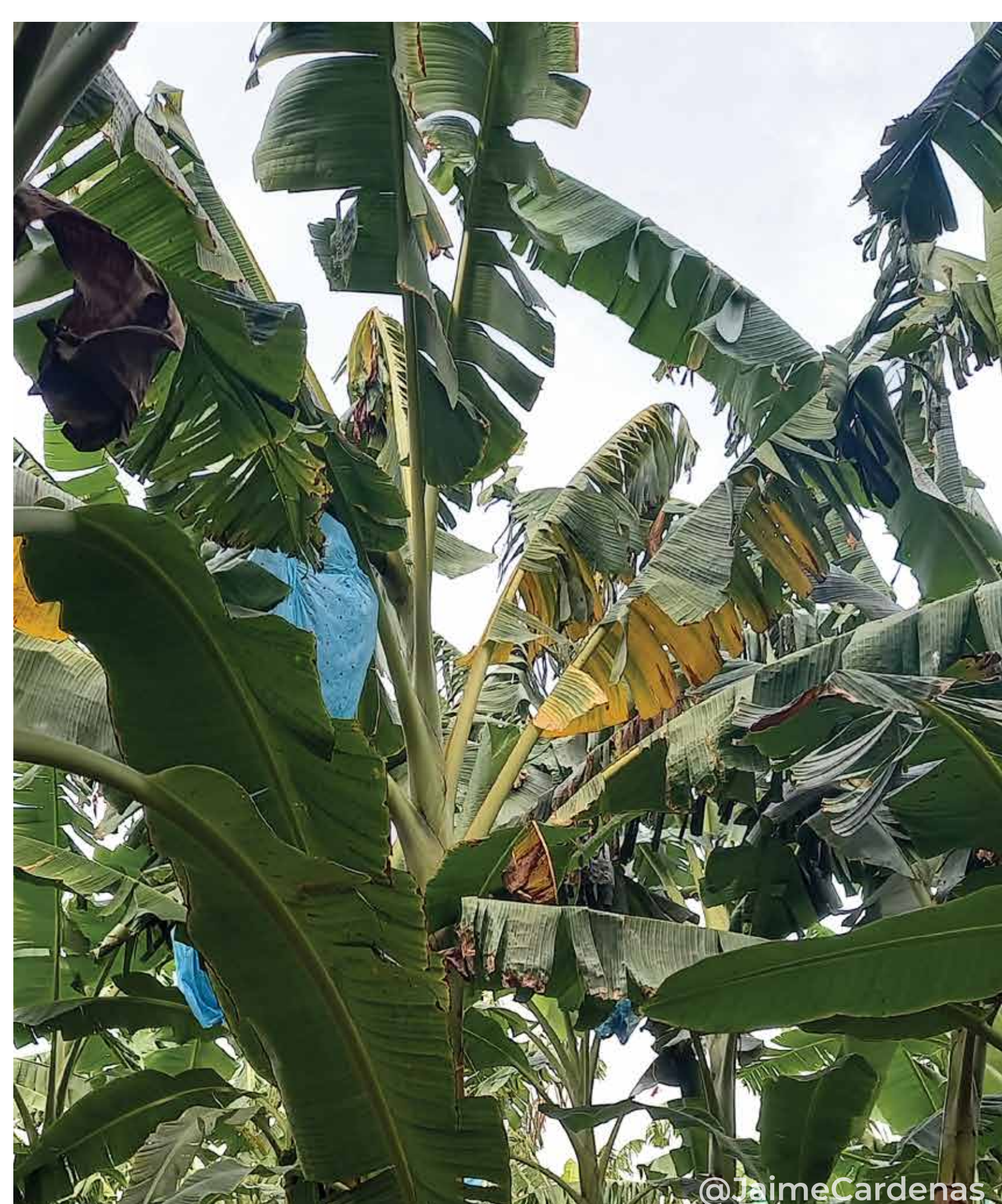
Yellowing of leaf at the base of older leaves.