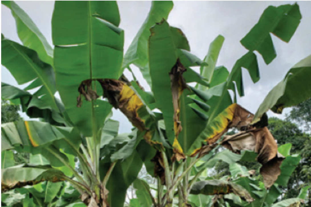
Figure 1: Adult banana plant infected with FOC TR4 exhibiting leaf yellowing and wilt.