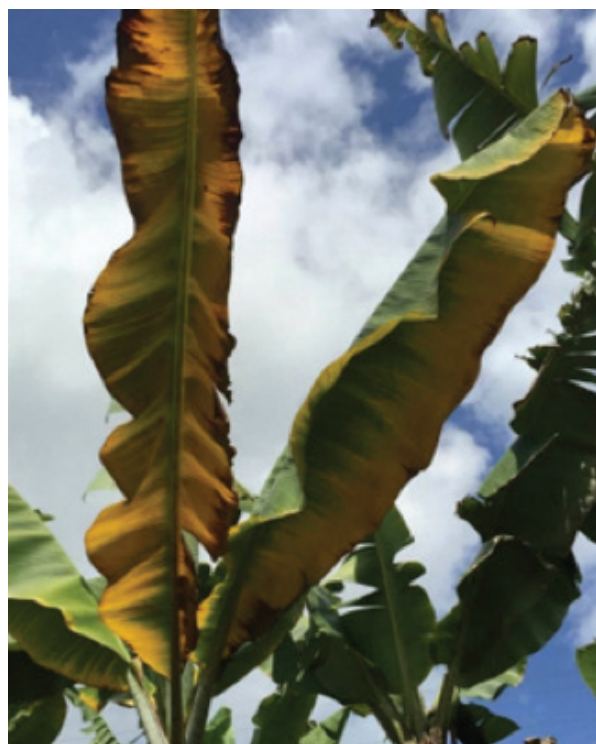
Figure 2: Early stage of FOC TR4 infection – leaf yellowing and edges turn brown.

The pseudostems (the part of the banana tree that looks like a trunk) may split lengthwise and, when cut open, a reddish-brown discolouration of the vascular tissue is typically seen (Figure 3). A reddish-brown discolouration may also be seen in the roots and rhizomes. New leaves may be paler and shorter than normal. Fruits exhibit no symptoms.