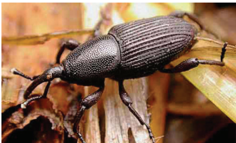
Figure 5: Adult banana weevil, Cosmopolites sordidus (Germar).